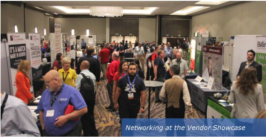
Networking at the Vendor Showcase