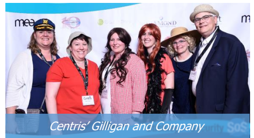
Centris' Gilligan and Company

After two full days of learning, it was time to have some fun at the closing reception just across the foyer where the hustle and bustle took place just hours prior. Clients, vendors, and employees showed up ready to party in their nautical-inspired attire. Some