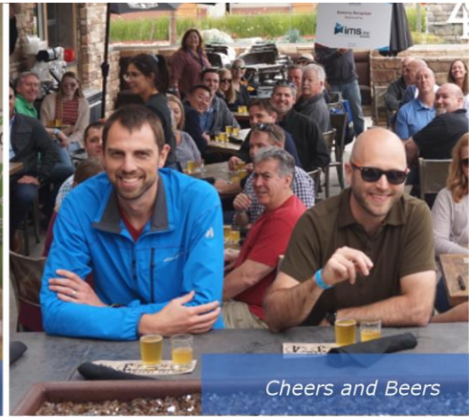
Cheers and Beers