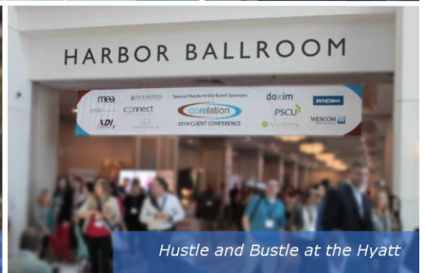
Hustle and Bustle at the Hyatt