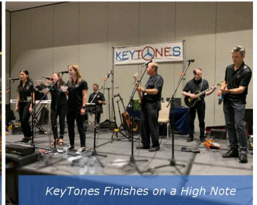
KeyTones Finishes on a High Note