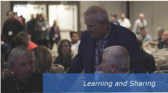
Learning and Sharing