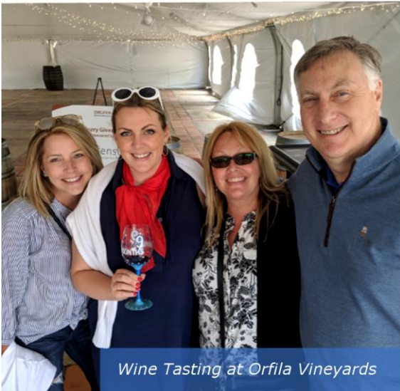
Wine Tasting at Orfila Vineyards