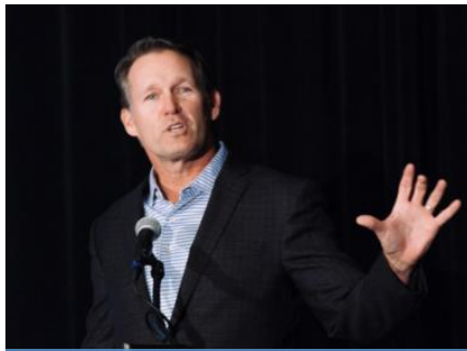
Keynote Speaker Dan Jansen