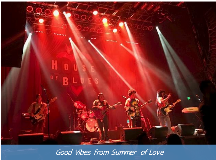
Good Vibes from Summer of Love