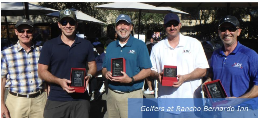
Golfers at Rancho Bernardo Inn