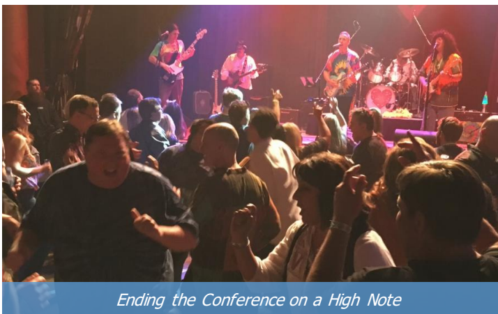
Ending the Conference on a High Note

Next year's conference is moving to the Manchester Grand Hyatt. Don't forget to mark May 21-23, 2019 on your calendar. Be there or be square! 📅