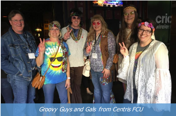
Groovy Guys and Gals from Centris FCU