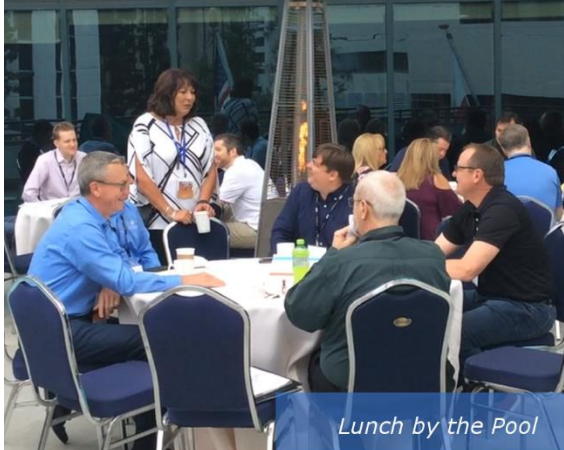
Lunch by the Pool