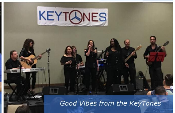
Good Vibes from the KeyTones