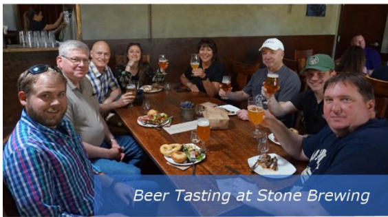
Beer Tasting at Stone Brewing