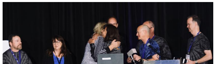
Harbor FCU Honored by the First Corelation Conversion Team