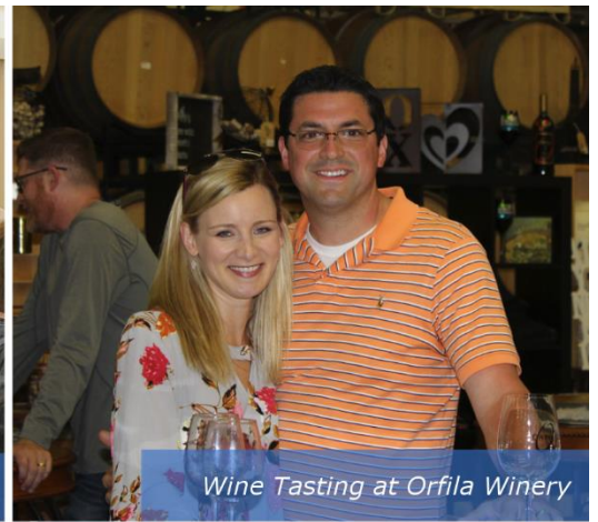
Wine Tasting at Orfila Winery