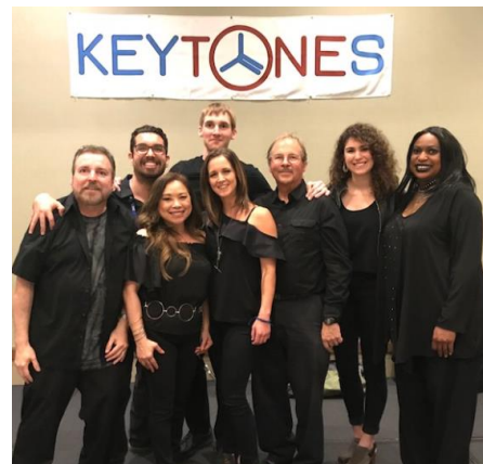
Corelation's KeyTones Band

Wednesday's break-out sessions were loaded with great information. The New Client, Operational, Technical and Executive tracks were all well-attended.