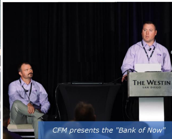
CFM presents the "Bank of Now"