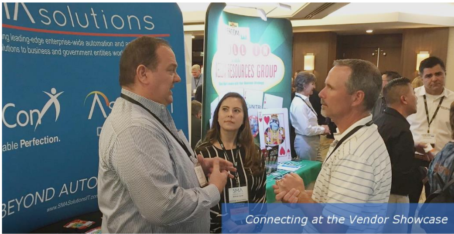
Connecting at the Vendor Showcase