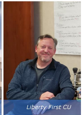
Liberty First CU