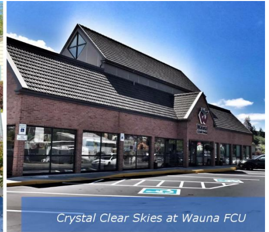
Crystal Clear Skies at Wauna FCU