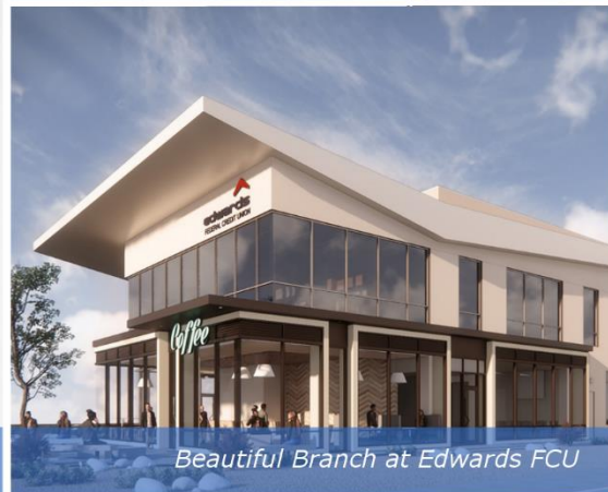
Beautiful Branch at Edwards FCU