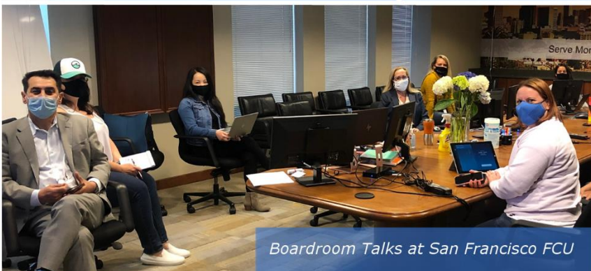
Boardroom Talks at San Francisco FCU