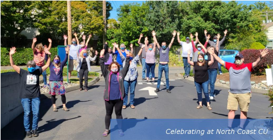
Celebrating at North Coast CU