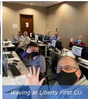
Waving at Liberty First CU