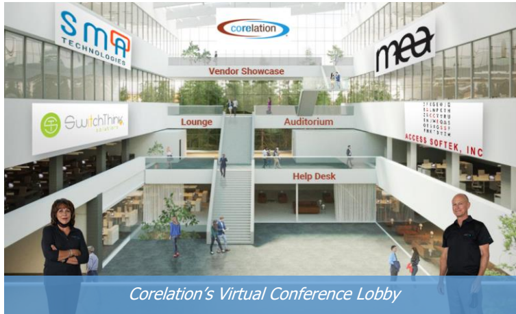
Corelation's Virtual Conference Lobby

Looking back on the year behind us, it is easy to say that 2020 has been a year of disruption. Every one of us has experienced the 'new normal' in all areas of life. How fitting, then, that the 'core disruption' theme of Corelation's 9th annual client conference encapsulates a core that is making waves in the industry like no other. While health concerns and event restrictions may have kept us apart, Corelation's first-ever virtual conference proved to be just as lively, informative, and thought-provoking as always.