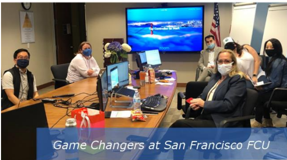
Game Changers at San Francisco FCU