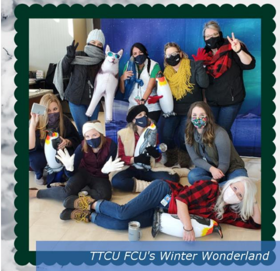
TTCU FCU's Winter Wonderland