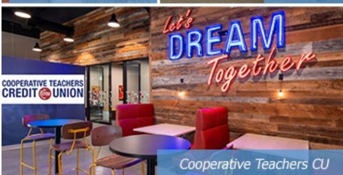
Cooperative Teachers CU