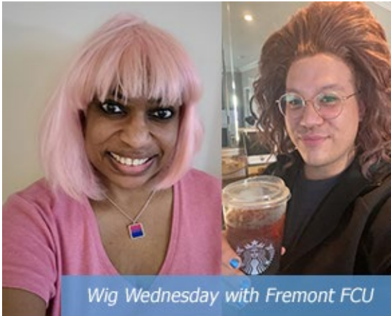
Wig Wednesday with Fremont FCU