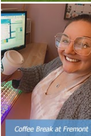
Coffee Break at Fremont