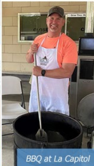
BBQ at La Capitol