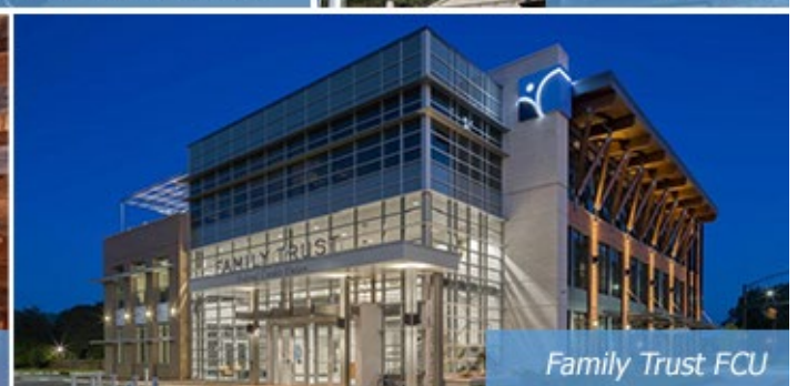
Family Trust FCU