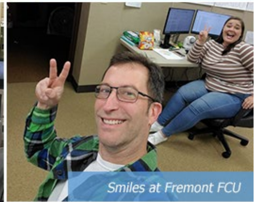
Smiles at Fremont FCU