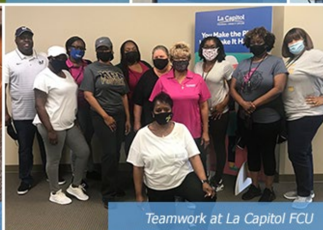
Teamwork at La Capitol FCU