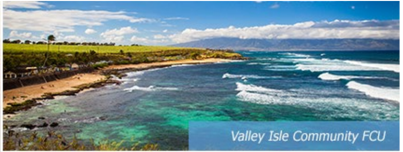
Valley Isle Community FCU