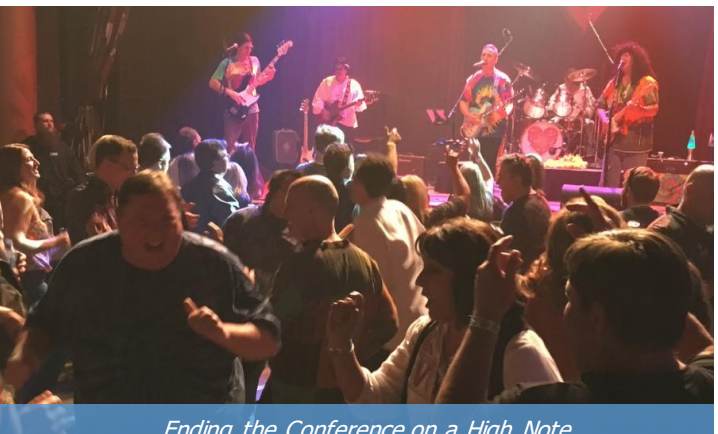
Ending the Conference on a High Note

Next year's conference is moving to the Manchester Grand Hyatt. Don't forget to mark May 21-23, 2019 on your calendar. Be there or be square!