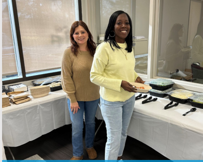
XCEL FCU Pause for a Pic