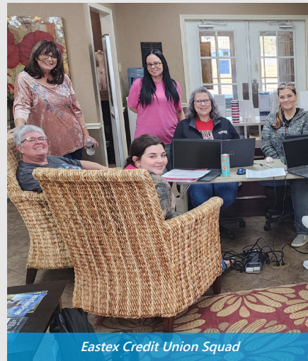
Eastex Credit Union Squad