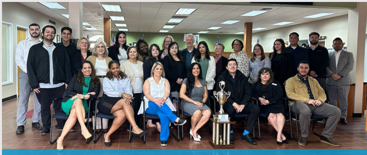
Glendale Area Schools Credit Union Team