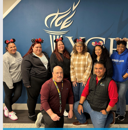
Disney Theme Conversion at XCEL FCU