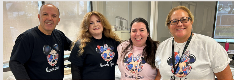
All Smiles at XCEL Federal Credit Union