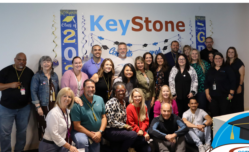
Corelation’s Leadership Academy - 2024 Graduation Ceremony

To reinforce the practical application of leadership skills, attendees participate in regular Cohort Group meetings that provide a safe space to connect with peers and discuss experiences, challenges, and support one another. These small groups not only build strong relationships across various departments, but they also create a shared vision for leadership at Corelation.