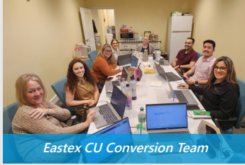
Eastex CU Conversion Team