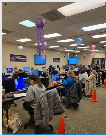
Genisys CU Hard at Work