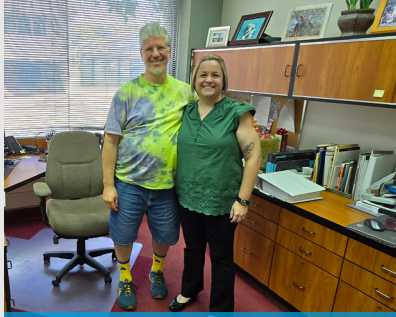
Welcome Glendale Area Schools CU