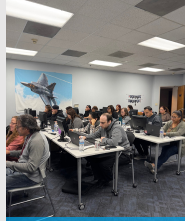
F&A FCU in Top Core Conversion Training