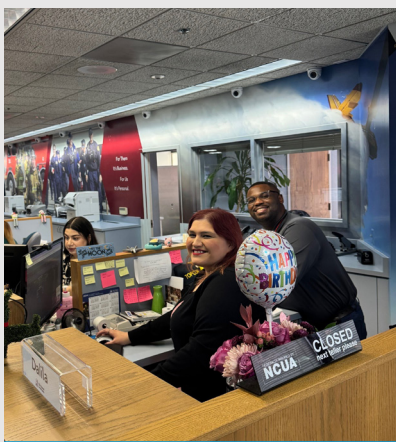
F&A FCU Ready to Convert to KeyStone