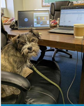
Glendale Area Schools CU Mascot