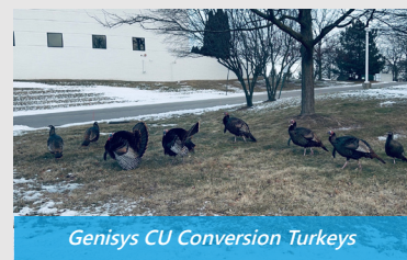
Genisys CU Conversion Turkeys