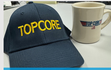
F&A FCU has the Top Core